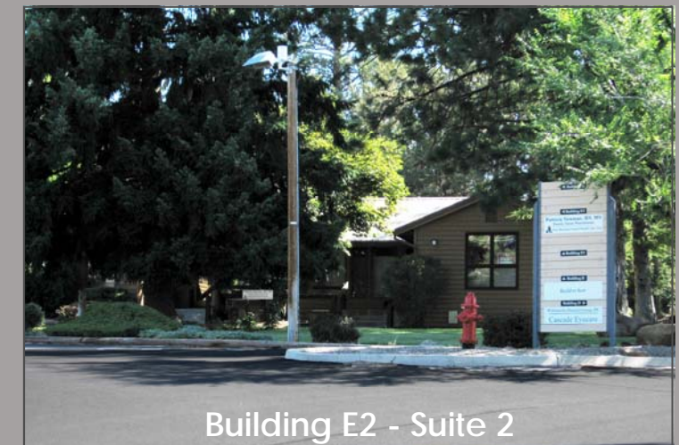
Building E2 - Suite 2

Building E2 Suite 2 A 751 +/- SF Office Suite Offered at $0.75/SF/Mo NNN CAMs estimated at $0.35/SF/Mo All utilities included in the CAMs except phone & data.