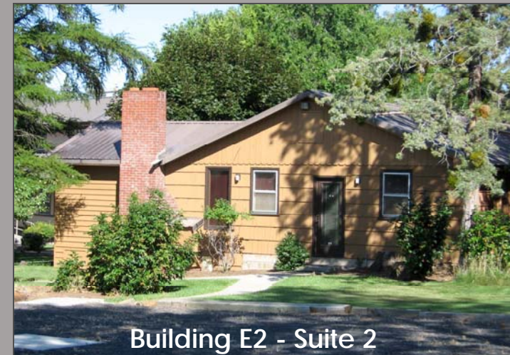
Building E2 - Suite 2

This property is zoned Commercial General (CG) allowing for the broadest range of permitted commercial uses in Bend.